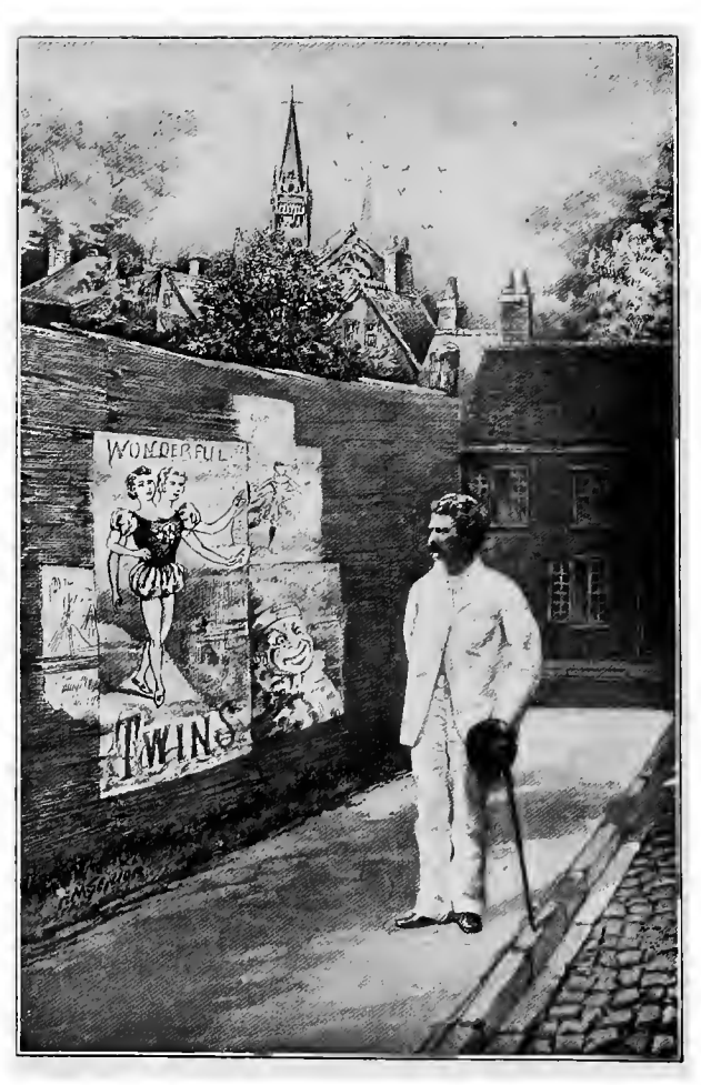
I THOUGHT I WOULD WRITE A LITTLE STORY"